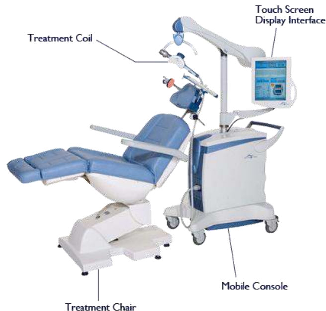
NeuroStar TMS Device

rTMS is a non-invasive, non-systemic treatment that utilizes MRI strength magnetic pulses to stimulate areas of the brain known to be underactive in depression.